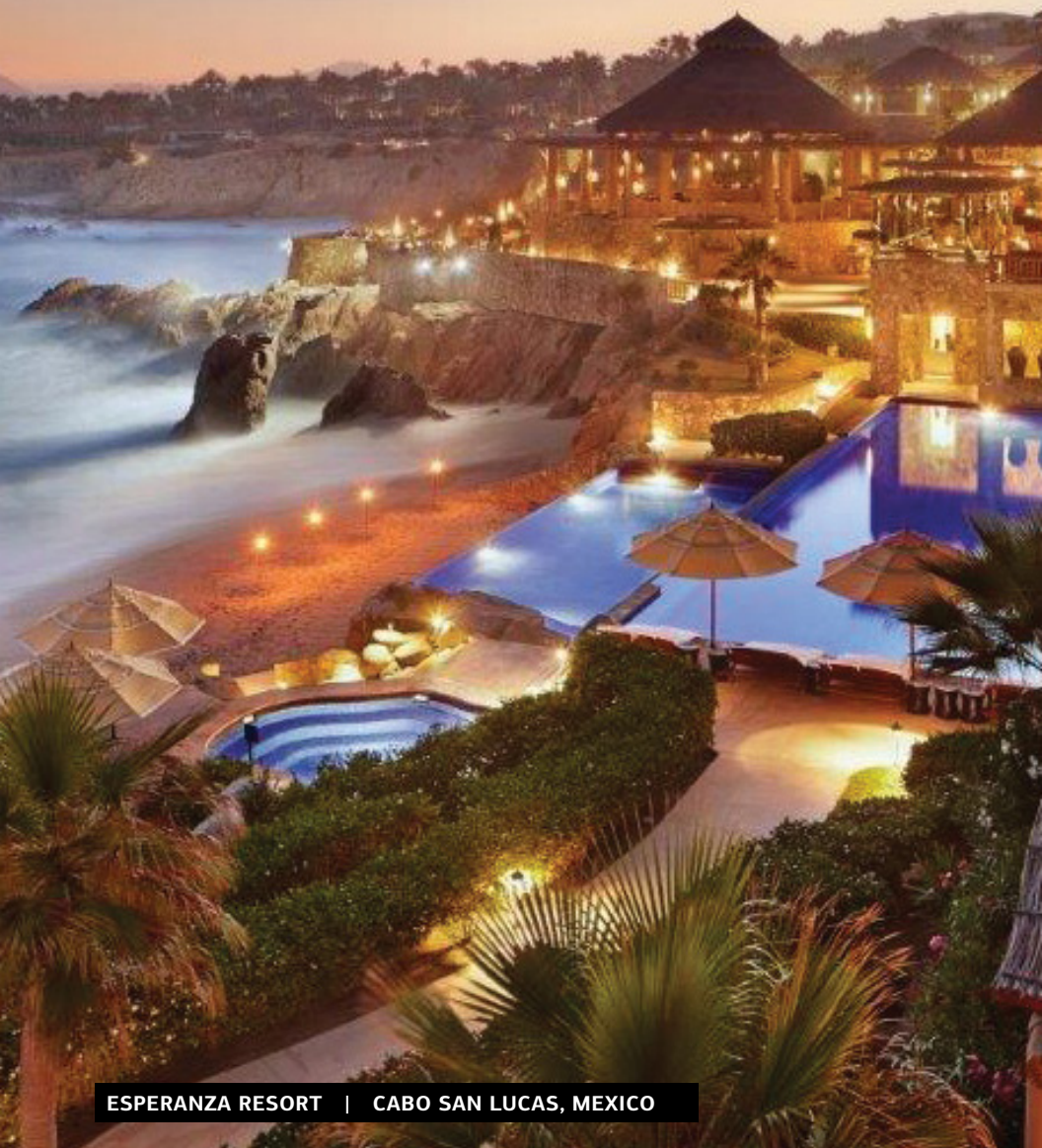
ESPERANZA RESORT | CABO SAN LUCAS, MEXICO