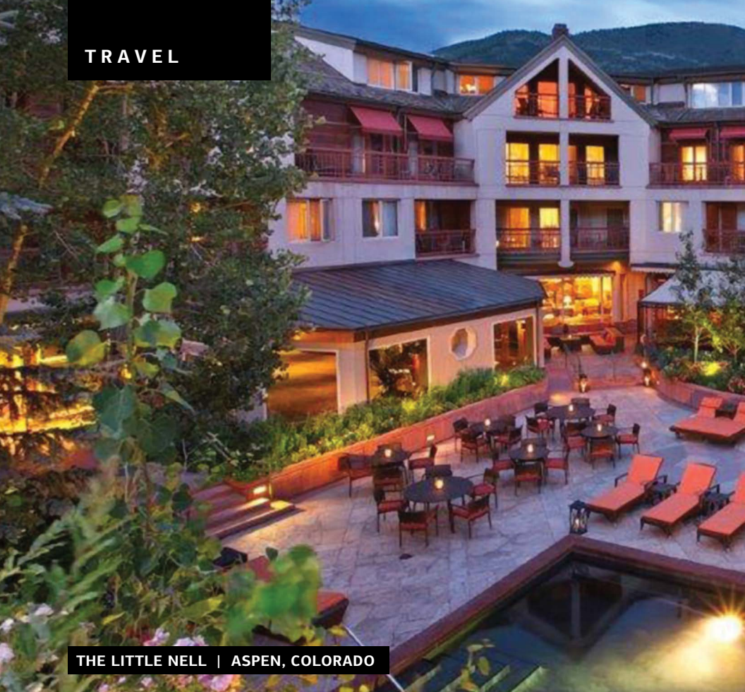
THE LITTLE NELL | ASPEN, COLORADO